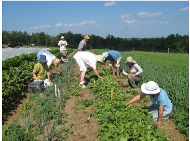
Everybody does farm work!